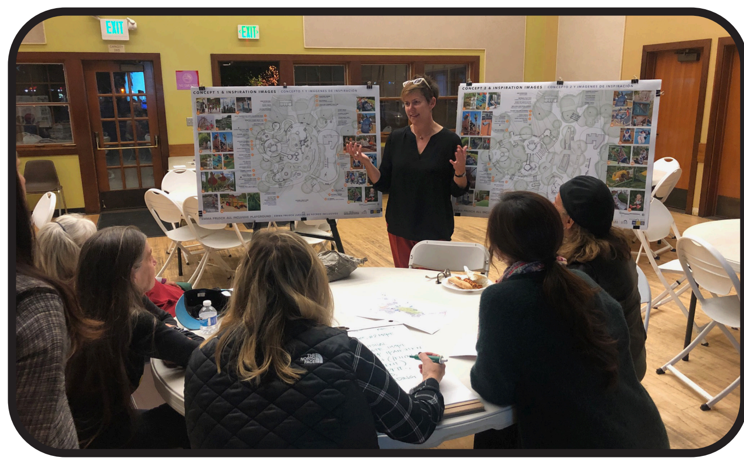
Example of Park Planning Community Engagement Meeting