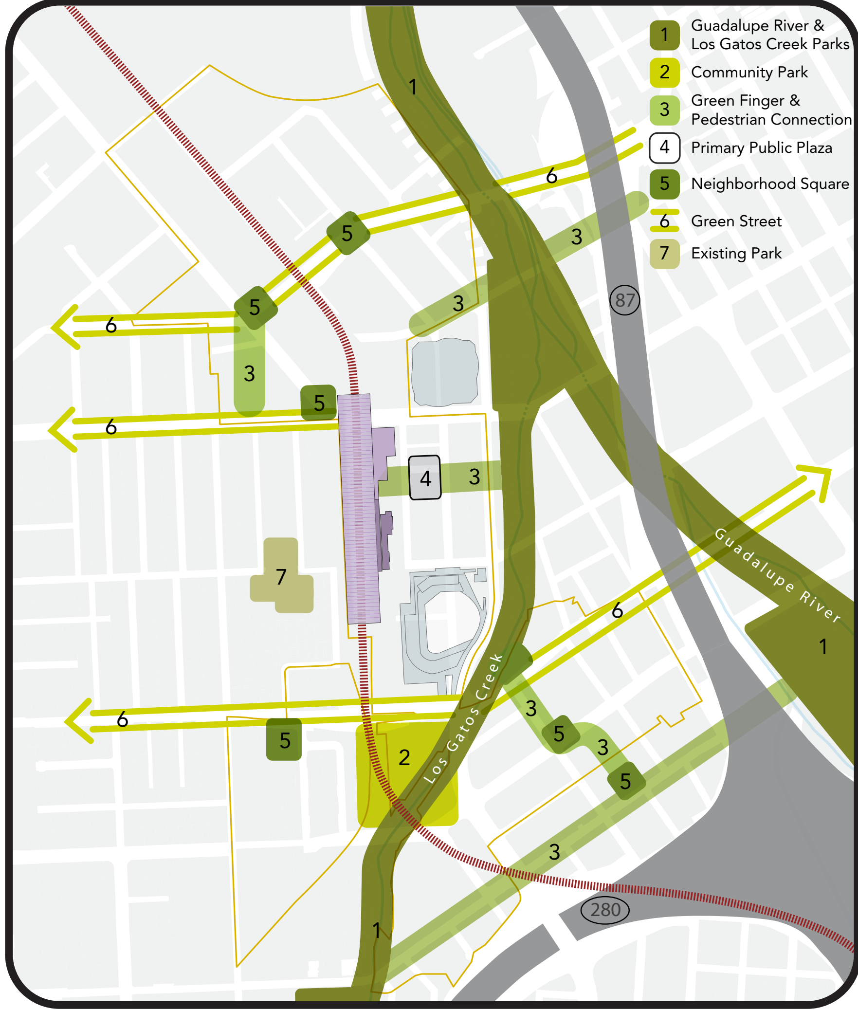
Figure 2-3-1: Landscaping and Open Space Strategy; Page 2-38; Diridon Station Area Plan - Final Plan Report