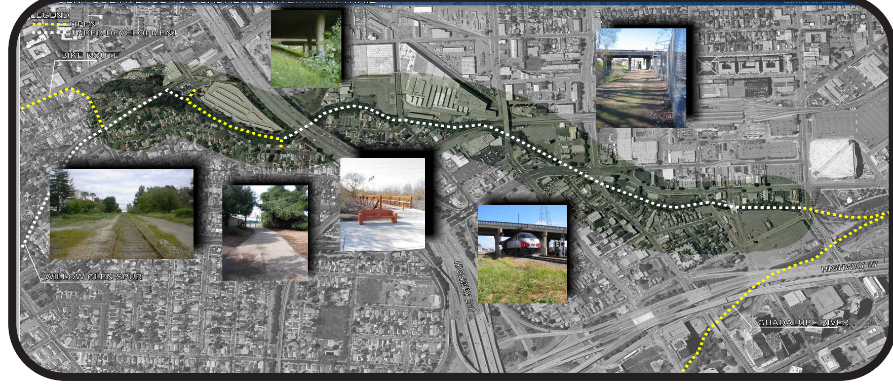
Los Gatos Creek Trail Alignment - Reach 5; PRNS Presentation Graphic