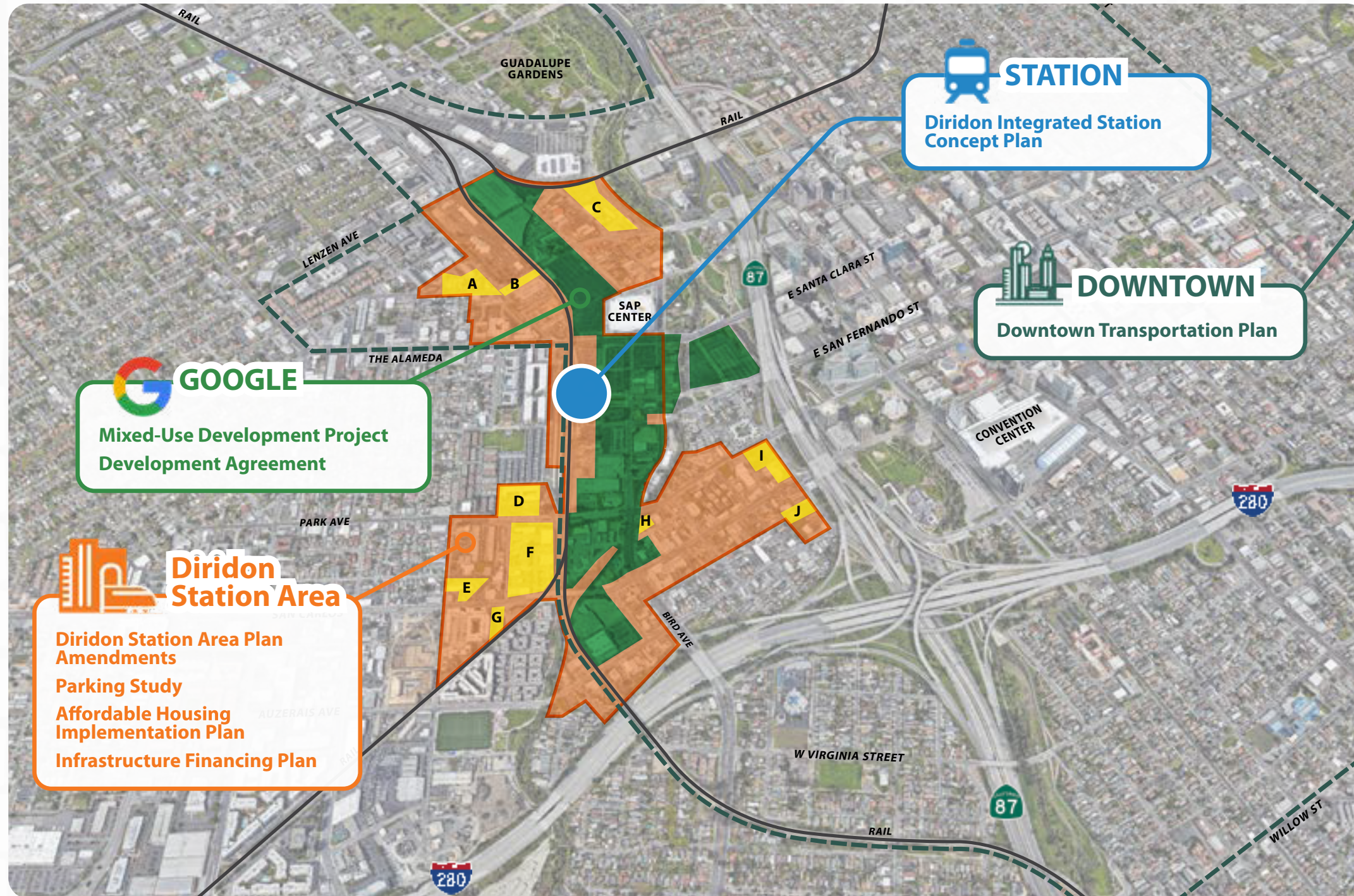
DOWNTOWN SAN JOSE